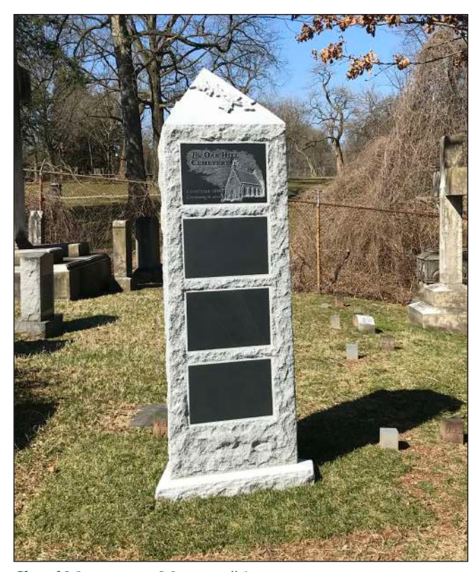
Shared Monument at Montrose #5

Early in 2019, a monument was installed along Path #5 in the Montrose section that gives families a new option for casket interments. As you know, Oak Hill has long been rather creative in the development of new casket and cremation spaces using former walk paths and other areas not originally designated for burials. Montrose #5 is another example. The pathway is sufficient for additional casket burials along its axis but there was not enough space, as there is in other pathways, for individual monumenting. The solution is to install a significant new monument