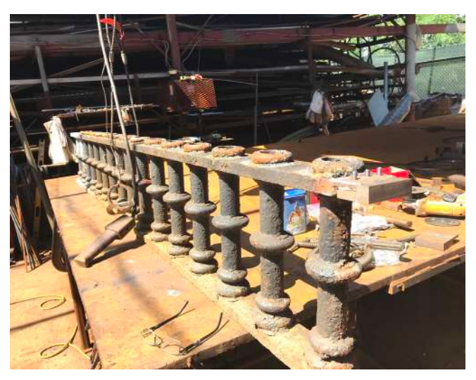
Bottom rails at Flaherty Iron Works after being dismantled

We have been writing about the cast iron fence along R Street since 2016 when we first described the origin of the fence and what its condition is after being in place for over 150 years. Needless to say that the overall condition of the fence has not improved over the past three years, with the exception of two panels near the Renwick Chapel. In the fall newsletter we reported that the foundations and stone piers under the fence posts were re-usable and did not have to be replaced in process of restoration. Only the part of the stone piers exposed above grade will have to be replaced which really helped simplify the process.