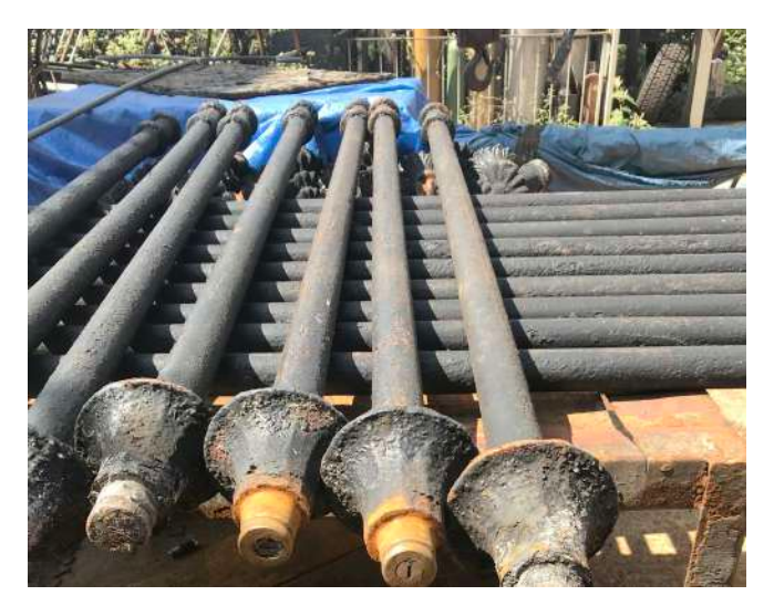
Bottom rails at Flaherty Iron Works after being dismantled

Phase one restoration on two sections of the fence has extended over the fall and winter. Flaherty Iron Works dismantled the two sections and removed all the pieces to their shop. Each piece was stripped and primed. Eventually the bottom two rails (which are a single piece) were reassembled with the rest of the posts, pickets, and rails on the site. Several challenges were encountered in these processes. The company doing the stripping of the parts realized that the project was much more involved than originally thought.