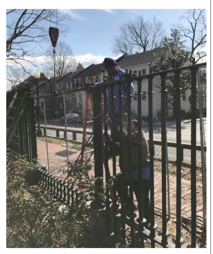
Setting pickets into the restored top and bottom rails