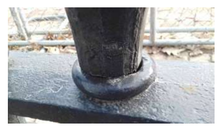
The bottom of a picket before epoxy

The final step is to put the third and final coat of paint on the restored portion of the fence. If you recall earlier articles, we know that the original paint color was a very dark yellowish green. For color purists, the color is Munsell Color 5.5GY /2 as described in the Munsell Color System. For those who are really curious, go to http://ocean-datacenter.ucsc.edu/PhytoBlog/Images/Munsell_A0[1].pdf to get an idea how deep and dark this green really is.