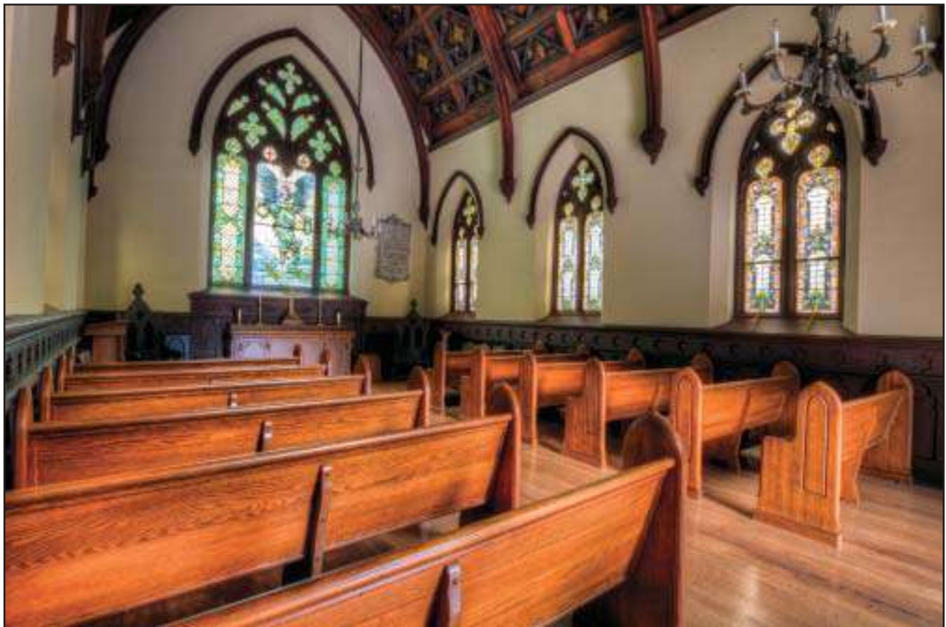
Interior of newly restored Renwick Chapel