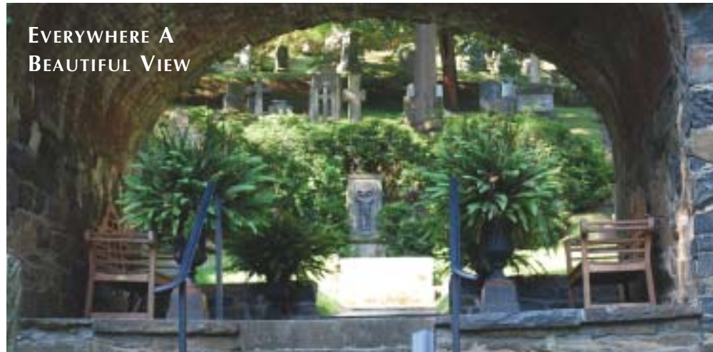
The tranquil Amphitheater Section, viewed through contemplation grotto, features a reduction of Augustus Saint-Gaudens' Amore Caritas bas-relief.