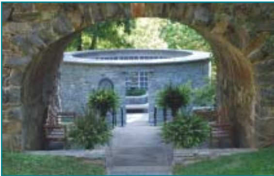
South entrance to columbarium viewed through sheltered seating area in grotto beneath our rustic bridge.