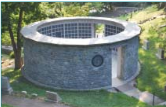
Overview of columbarium from Bridge Avenue with eastern end of parking lot visible beyond.