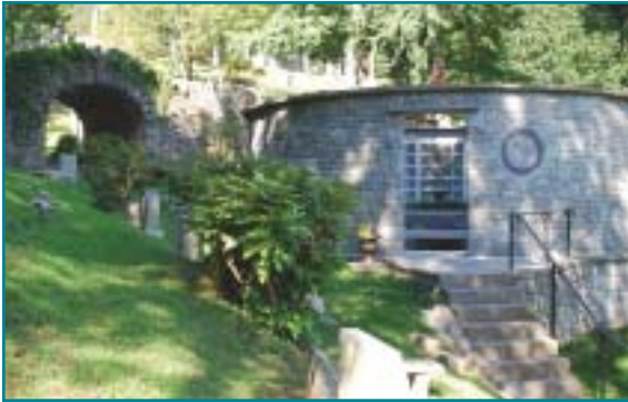
Northeast entrance and iron-railed landing used when approaching from the waterside parking lot at the foot of Rock Creek Avenue.